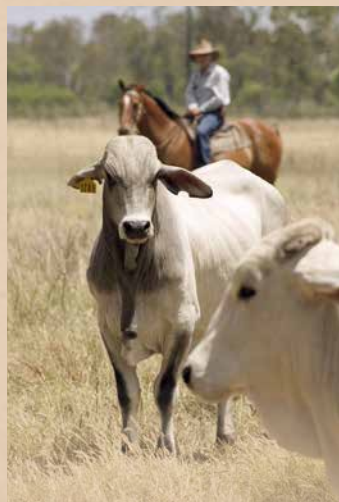
WALKING LONG DISTANCES