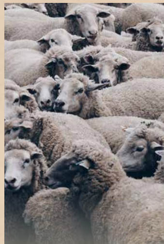
WEANING & YARDING