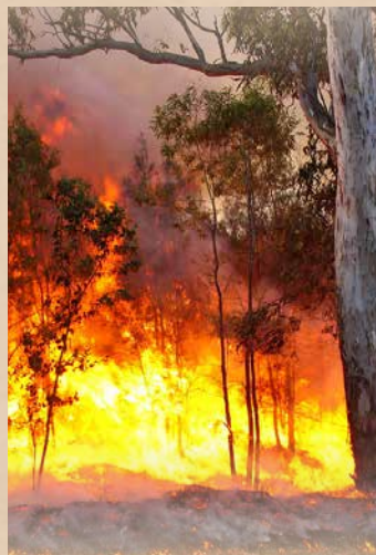
BUSHFIRES/ NATURAL DISASTERS